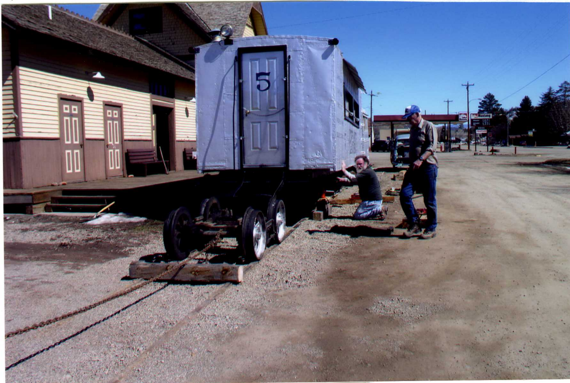
Late Spring 2004 - Trucks (wheel sets) Being Removed for Maintenance