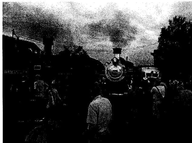
Saturday evening, Aug. 20 th the "Parade of Trains" was held in front of the D&S depot in Durango. The event featured five steam locomotive and Motor #5. People were given close access to the equipment and able to talk to the crews. The whistles on the locomotives were blown at the same time, and needless to say, # 5's horn was drowned out by the whistles !