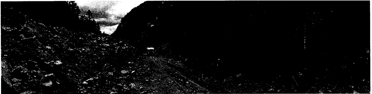
The spectacular panoramic photo above shows the Aug. 2 nd rock and mud slide that closed the D&S for several days about two weeks before Railfest. In the photo below, note the shattered stumps on the right side of the photo next to # 5. The slide contained an estimated 100,000 tons of rock and mud.

Tuesday August 16 th : The Goose was "readied" and loaded on the trailer in preparation for its trip to Durango. A major servicing was performed previously in the week in preparation for Railfest.