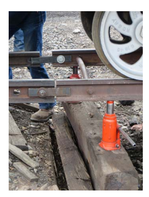
Ties and Bottle Jacks used to support and stabilize the rails.